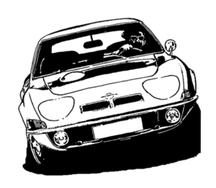
New Mounts provide a better response, for "spirited" driving!

The quality of isolation provided by drive line mounts helps to control factors producing resonance. Opel GT Source's exclusive new mounts better intercept and counteract these forces before they can be transmitted onto your car chassis, allowing you to enjoy a more "enthusiastic" approach during "pleasure driving" of your Classic Opel GT.